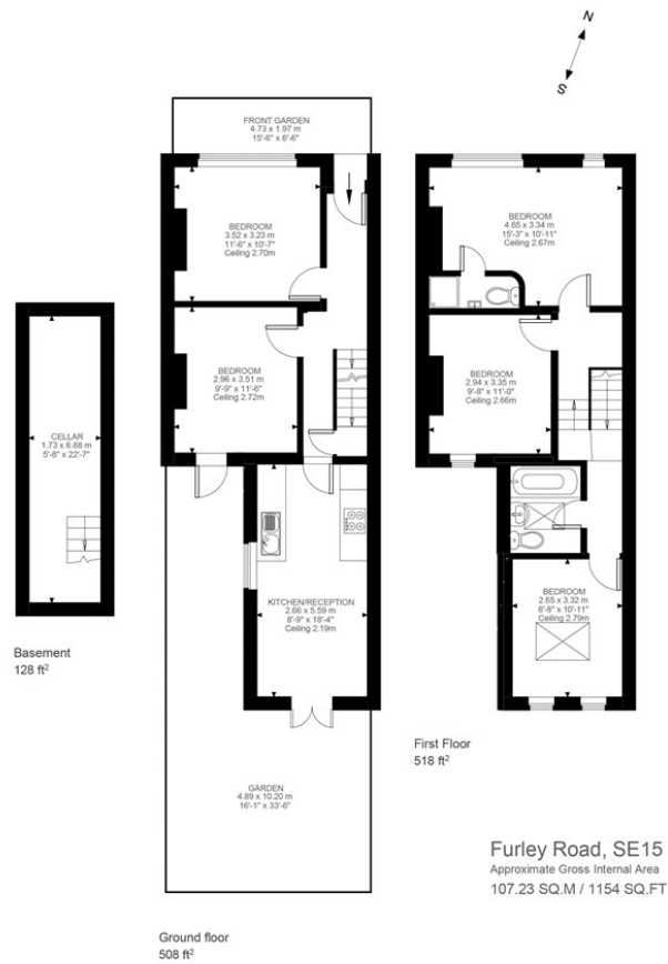
Illustration for identification purposes only. Not to scale. Floor Plan Drawn According To RICS Guidelines.